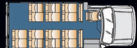
14 Passenger with Activity Bus Seats